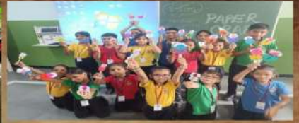
PAPER CRAFT ✂️ 📄