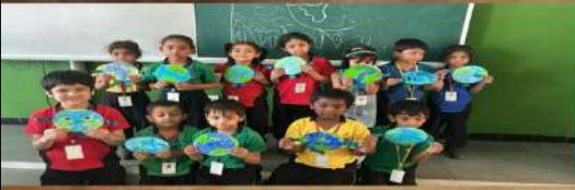
OUR SPHERE 🌍