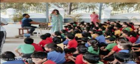
A DAY WITH POTTER