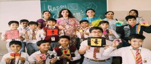
CHILDREN'S DAY Celebration