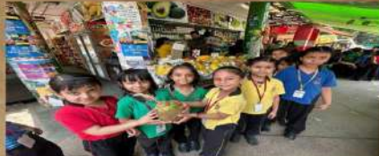
FRUIT BONANZA 🍎 🍌