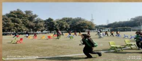
FUN GAMES 🏃 🎯