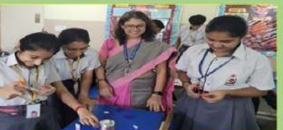
CRAFT WORK FOR DIWALI