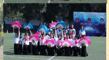
PREPSTERS' DAY A SPORTS DAY MEET...