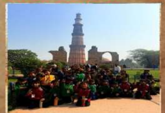
A VISIT TO QUTUB MINAR