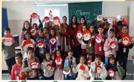
Christmas Day Celebration