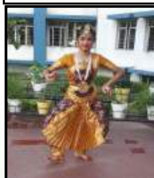
M A NAINIKA