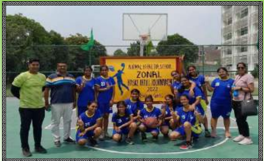
Senior Basketball Girls team of BGSIPS won the Third position at the ZONAL Basketball Tournament organized by the Directorate of Education , New Delhi.