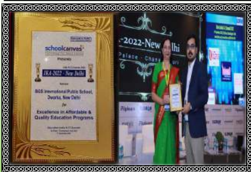
BGSIPS AWARDED FOR EXCELLENCE IN AFFORDABLE AND QUALITY EDUCATION in India K-12 awards IKA-2022 .