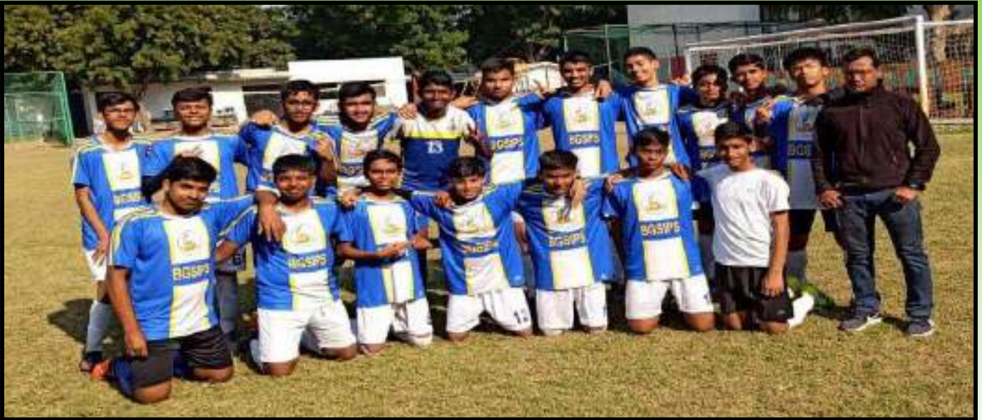
BGSIPS Junior football team won the Bronze medal at the ZONAL FOOTBALL TOURNAMENT organised by Department of Education, New Delhi.